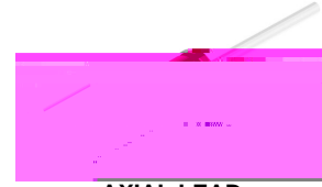
AXIAL LEAD (DO-35) CASE 017AG (Color Band Denotes Cathode)

Product parametric performance is indicated in the Electrical Characteristics for the listed test conditions, unless otherwise noted. Product performance may not be indicated by the Electrical Characteristics if operated under different conditions.